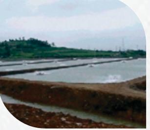
Committed to Timeliness and Quality Assurance